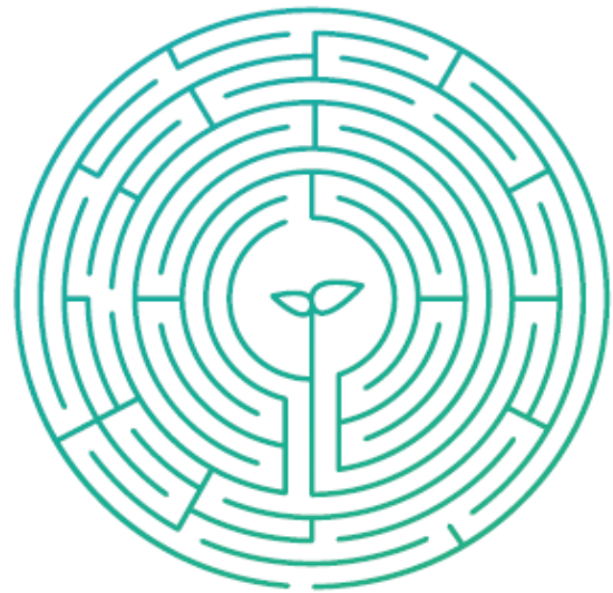
Grants & Incentives news